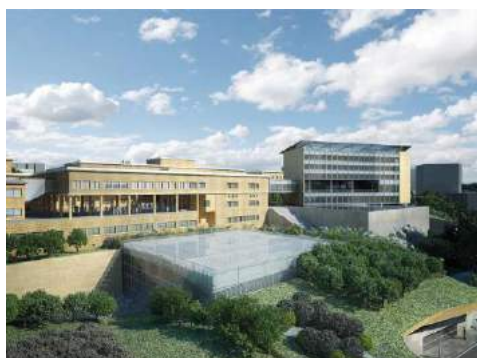
Outdoor view of the upcoming Sport Complex

To complete the picture, the new Sport complex will be built according to the highest sustainable environmental standards, including being powered completely by renewable energy. This will house the University's student sports programs - mini-football, basketball and tennis - under one roof, with facilities including training grounds, sports medicine, and offices for coaches and staff. The complex will also function as a cultural space for USEK community, housing activities such as concerts and giving students a vibrant meeting point.