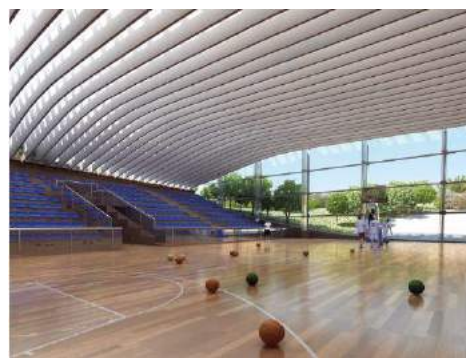
Indoor view of the upcoming Sport Complex

For more information and contacts, check usek.edu.lb .