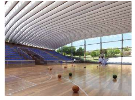
Indoor view of the upcoming Sport Complex