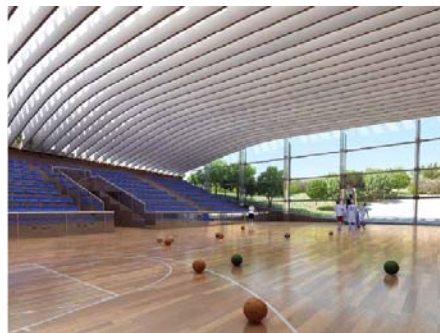
Indoor view of the upcoming Sport Complex

For more information and contacts, check usek.edu.lb .