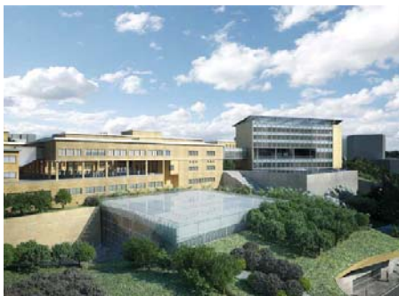
Outdoor view of the upcoming Sport Complex

To complete the picture, the new Sport complex will be built according to the highest sustainable environmental standards, including being powered completely by renewable energy. This will house the University's student sports programs - mini-football, basketball and tennis - under one roof, with facilities including training grounds, sports medicine, and offices for coaches and staff. The complex will also function as a cultural space for USEK community, housing activities such as concerts and giving students a vibrant meeting point.