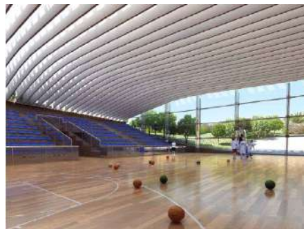
Indoor view of the upcoming Sport Complex

For more information and contacts, check usek.edu.lb .